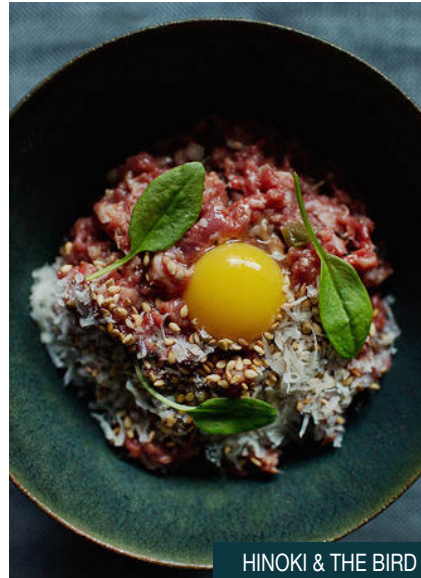
HINOKI & THE BIRD