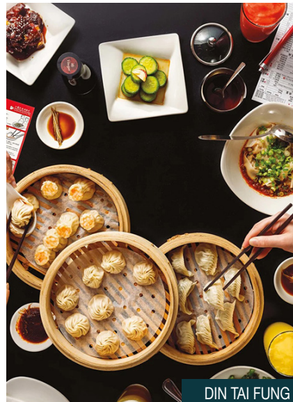
DIN TAI FUNG