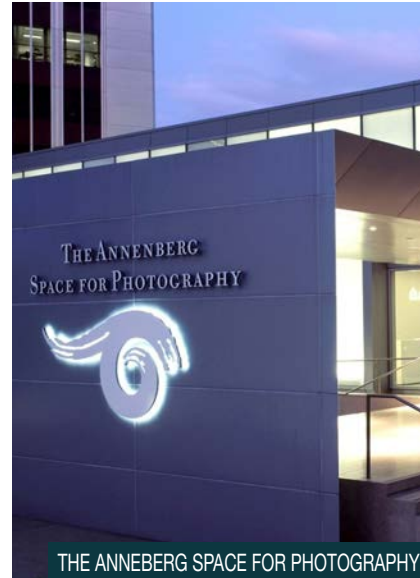
THE ANNEBERG SPACE FOR PHOTOGRAPHY