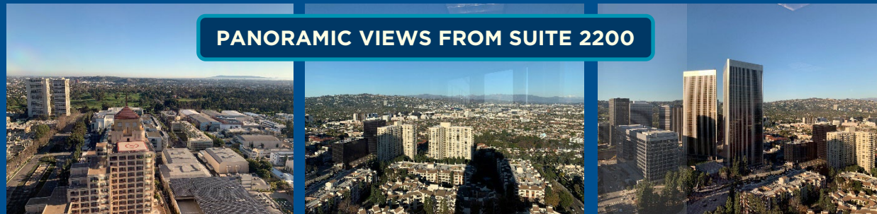
PANORAMIC VIEWS FROM SUITE 2200