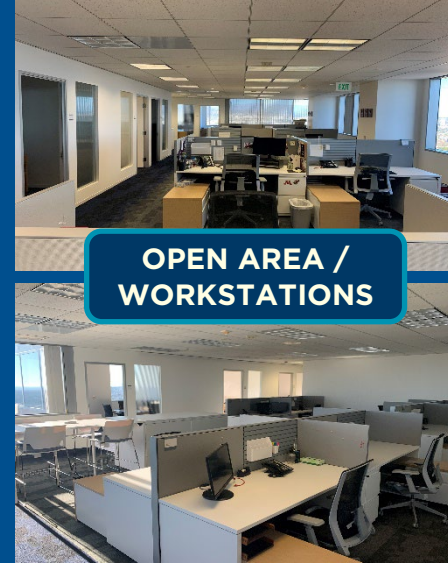
OPEN AREA / WORKSTATIONS