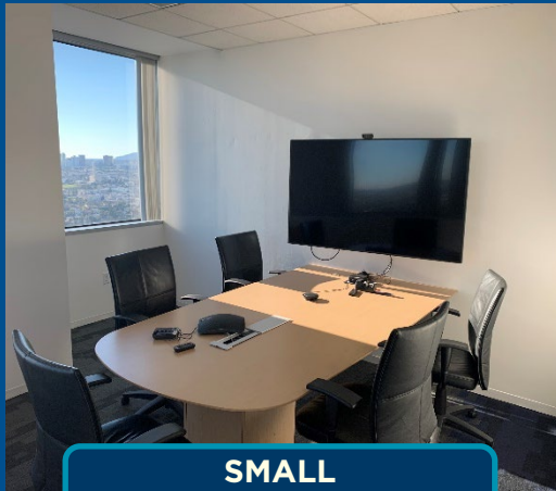
SMALL CONFERENCE ROOM