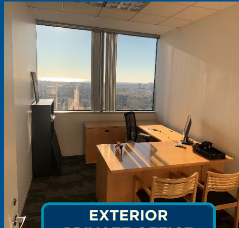
EXTERIOR PRIVATE OFFICE